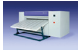
Above: PlateRite Ultima 24000.