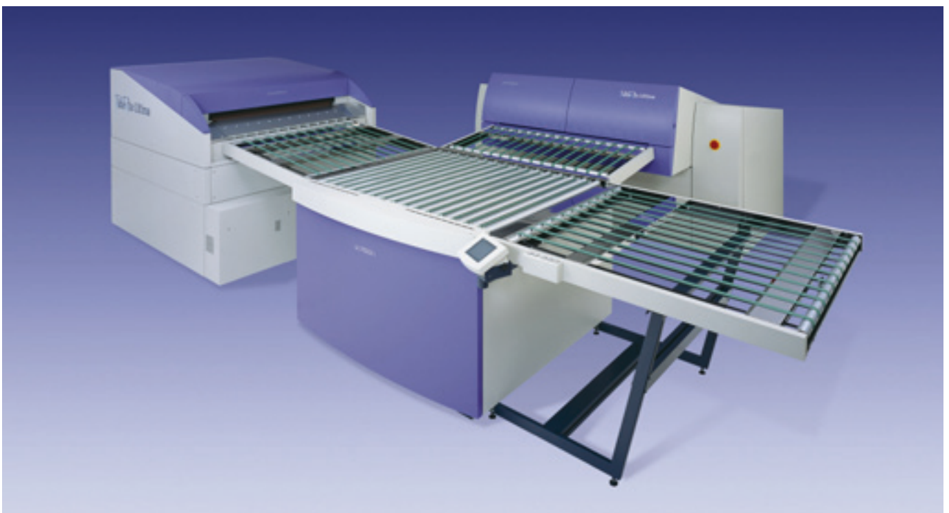
PlateRite Ultima 16000II with autoloader.

Not only can the advanced PlateRite Ultima large-format platesetters load a single large-size plate onto the drum, they can also load pairs of smaller plates together. Imaging pairs of plates increases productivity as plates need to be loaded and unloaded fewer times. The PlateRite Ultima 36000 and 24000 ZX and Z series models also feature twin imaging heads that enable simultaneous imaging of two plates, for even higher production.